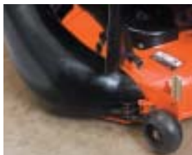
Gate open with grass catcher attached

Using the optional grass catcher is now easier than ever. Due to the powerful flow of the Infinity Deck, a blower is no longer needed—the deck does all the work. With this design, attaching the grass catcher's boot is made simple.