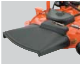
Gate open with discharge chute

In this mode, the deck discharges grass evenly and efficiently through the side of the deck, utilizing two counter-rotating blades. The flow created by these blades is where the Infinity Deck gets its name.